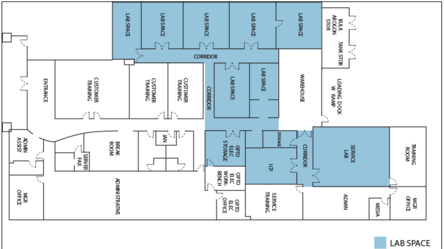
Floor Plan 13,995 RSF